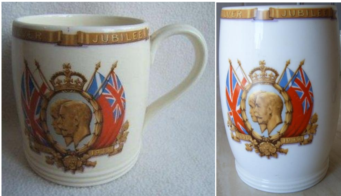
Figure 2: The mug and beaker presented to the children of Kildwick School.