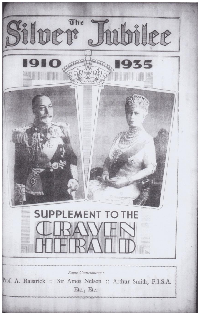
Figure 3: Cover of the Craven Herald commemorative supplement, May 3 rd 1935

In the May 10 th issue, they had a full report of the celebrations in Farnhill and Kildwick; reproduced, in full, below. The results of the children's sports events include the names of some families still well known in the local area.